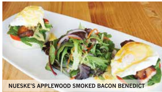
NUESKE'S APPLEWOOD SMOKED BACON BENEDICT

NUESKE'S APPLEWOOD SMOKED BENEDICT 20.99