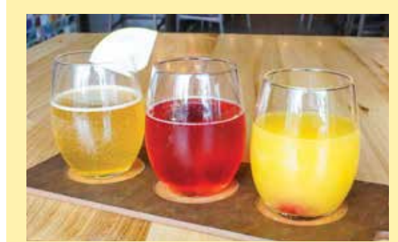
MIMOSA FLIGHT 20.99